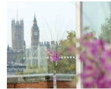
Lunch will be served in the impressive Riverside Room overlooking the Thames