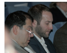
Delegates from our successful Spring Conference